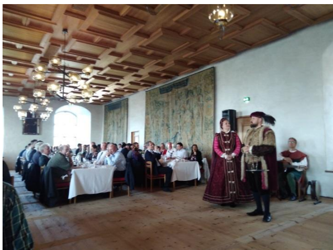
FRPM conference dinner 2019, Turku castle

Nordtreat is a North European innovation SME, established in 2015 to develop and market fire protection solutions for wood. The company today operates two manufacturing facilities in Finland and Estonia, as well as supporting sales offices in Germany and Norway. The company offers flame retardant formulation, sales and services for wooden interior and exterior panels, engineering wood and structural timber products. Nordtreat's products are based on food-grade raw materials, water-based and non-halogenated, following the slogan "Transparent by Nature". They can be surface or vacuum applied. The company today offers the only water-based, translucent fire safety coating for wood with EN 16755 "EXT" durability (exterior use). www.nordtreat.com